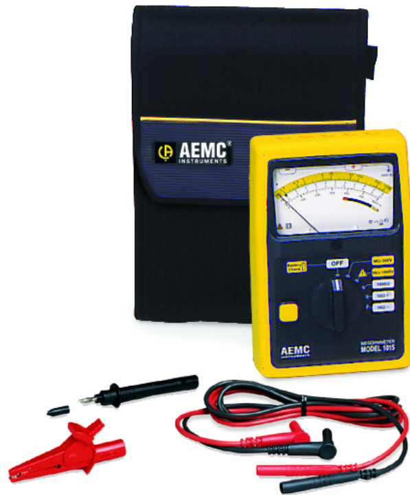
Model 1015 includes carrying case, shockproof rubber housing, two color-coded leads, red insulated alligator clip, black test probe, spare fuse, batteries and user manual