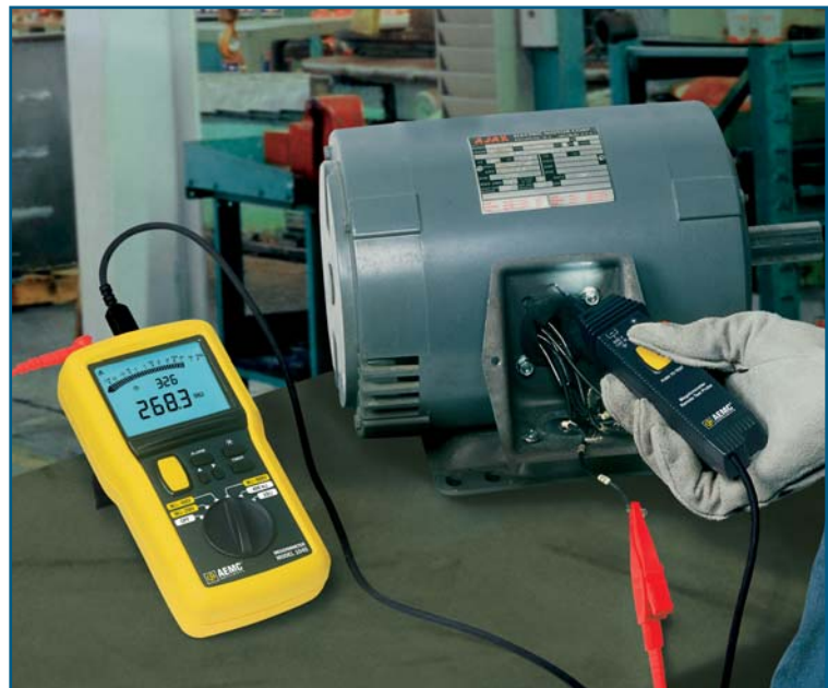
Remote probe used with Model 1045 to initiate a test at the motor. Target light provides good visibility of test area.