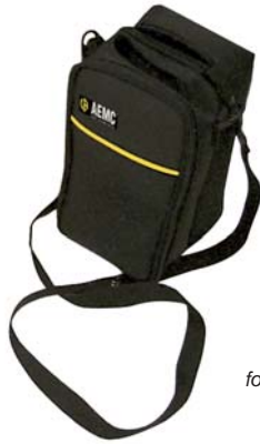
Hands-Free Carrying Case for use with all models Catalog #2118.99