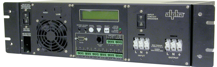
Novus FXM UPS

Outdoor UPS with 650, 1100, or 2000 W/VA Output