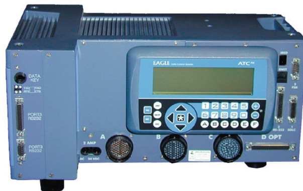
EAGLE EPAC M52 TS-2, Type 2 Controller w/ Datakey™ Card (optional)

The M50 Series Controller Unit has a removable LCD alphanumeric backlit display unit (8-line · 40 char/line). Programming is easy and error free using English Language Menus. Within a menu, each parameter can be viewed and a cursor moved to that parameter for changes. Related parameters are visible simultaneously, making verification an easy matter. The screen provides both programming area identification and editing prompts. The M50 can also be utilized as a master control unit using SE-MARC Master software.