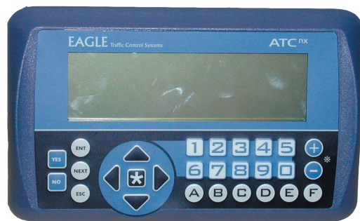
Removable Hand-held Display

Controller assemblies with TS-2 Monitors provide additional diagnostic data to the Controller Unit via the SDLC port.