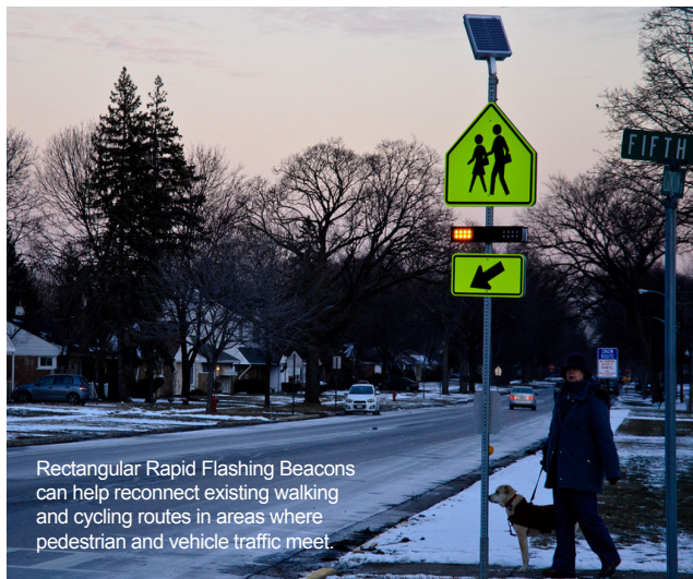
Rectangular Rapid Flashing Beacons can help reconnect existing walking and cycling routes in areas where pedestrian and vehicle traffic meet.

Rectangular Rapid Flashing Beacons are not intended for crosswalks that already have stop signs, yield signs or traffic control signals.