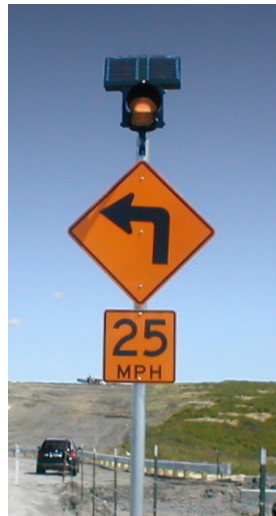
REDUCE SPEED MARKER - FREMONT, CA