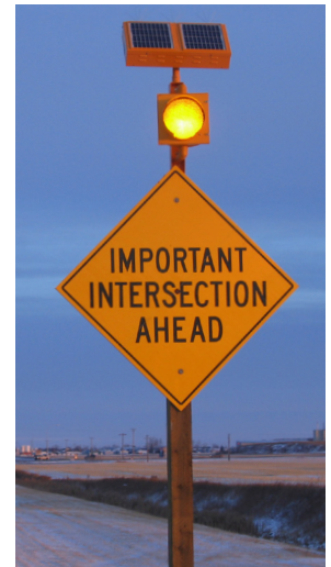
INTERSECTION AHEAD - MORINVILLE, AB

Carmanah is backed by a worldwide network of distribution partners. To find a representative in your region: