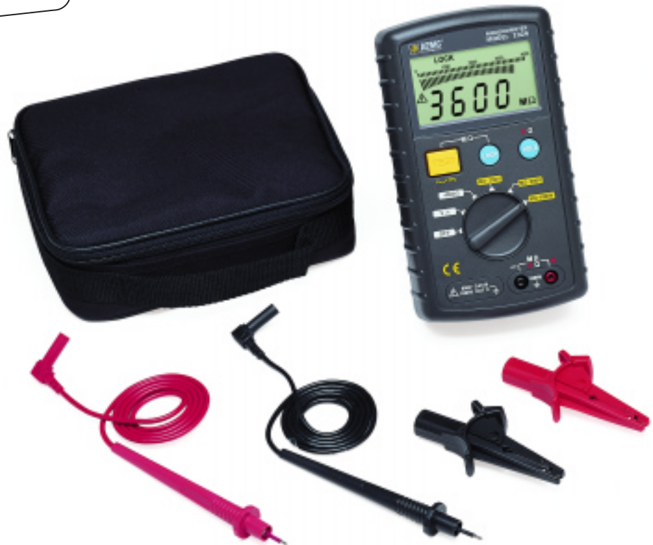
Soft carrying case and test leads included