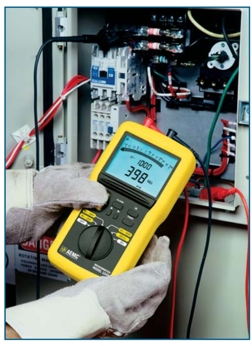
Easy-to-read digital/analog display (backlight on)