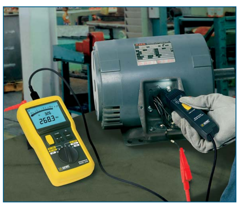
Remote probe used with Model 1045 to initiate a test at the motor. Target light provides good visibility of test area.