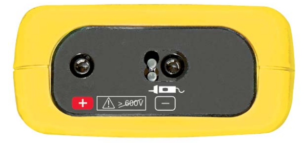
Models 1040 & 1045