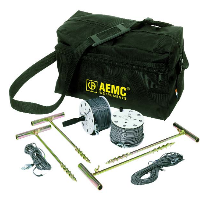
Test Kit for Models 4600 & 4610 includes four auxiliary ground electrodes, two 300 ft leads on reels with wind-up handles, one 90 ft lead and one 16 ft lead in hard carrying case (Catalog #2118.31)