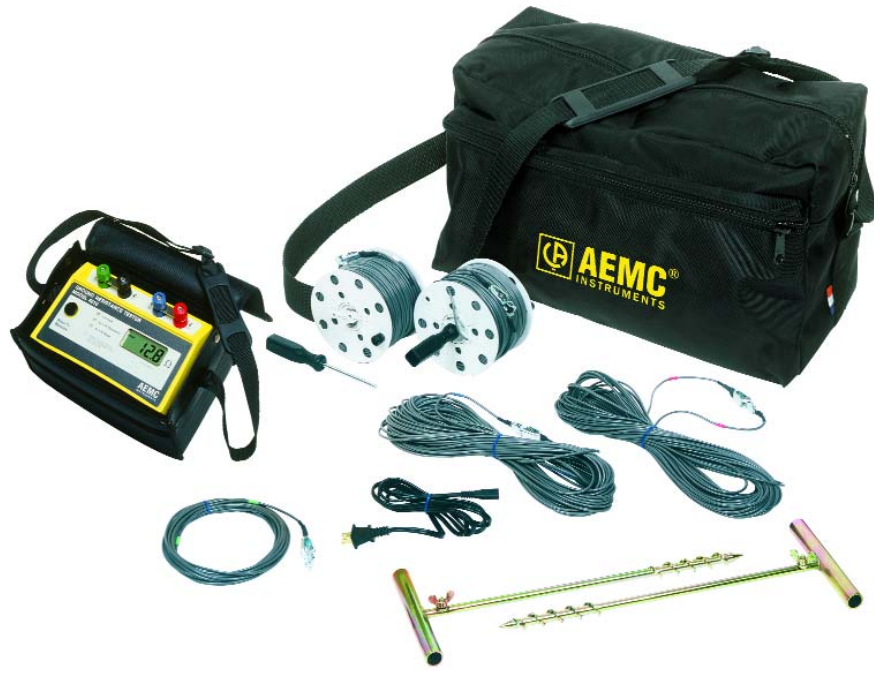
Digital Ground Resistance Tester Model 4610 Kit (Catalog #2114.95)