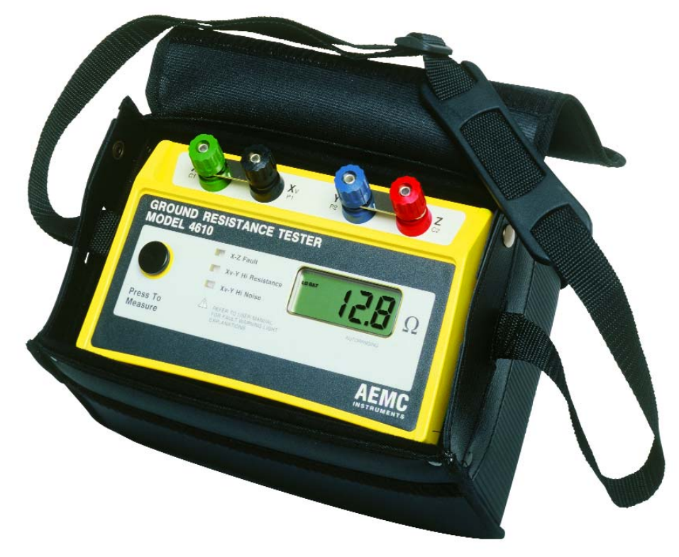
Model 4610 shown in standard soft carrying case Catalog #2114.94