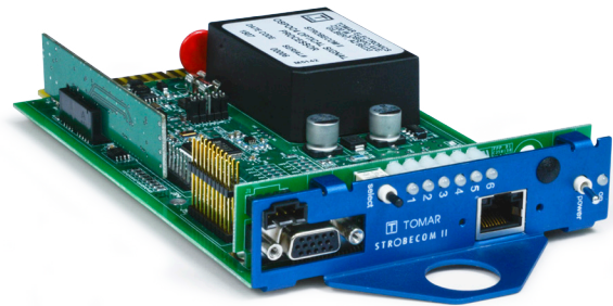
OSPOC x Family OSP

*OPTICOM and GTT are trademarks of Global Traffic Technologies, LLC and are not affiliated with Tomar Electronics, Inc. or its products