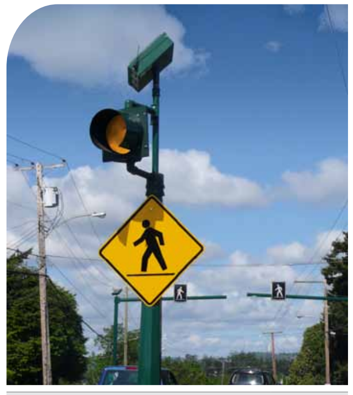
INSTALLATIONS AND APPLICATIONS