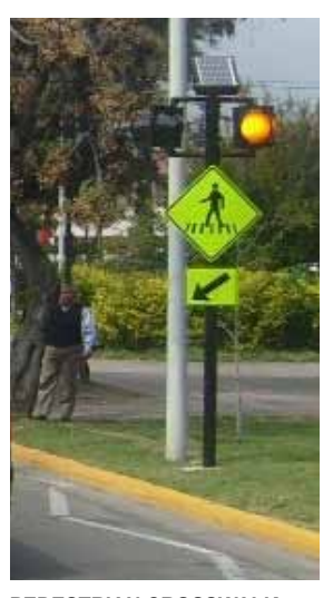
PEDESTRIAN CROSSWALK - SANTIAGO, CHILE

Carmanah is backed by a worldwide network of distribution partners. To find a representative in your region: