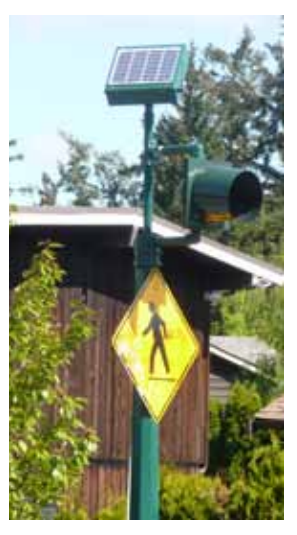
PEDESTRIAN CROSSWALK - VICTORIA, BC