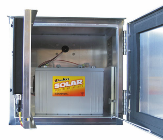
Battery is easily accessible.

AC powered school zone systems are also available from RTC.