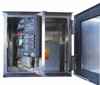
Electronics mounted on swing-out panel for easy access.