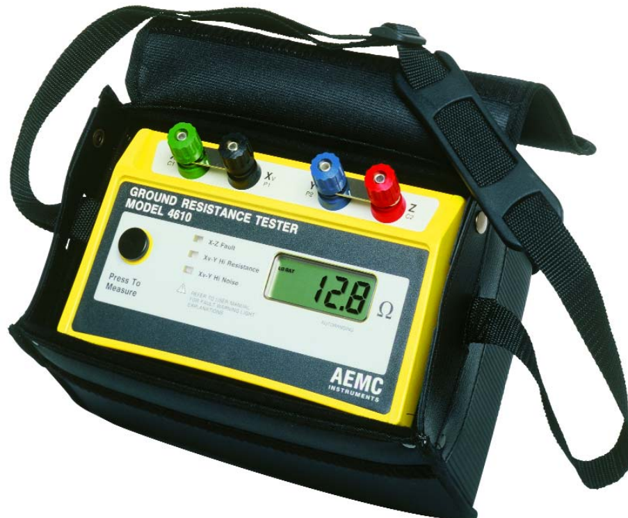
Model 4610 shown in standard soft carrying case Catalog #2114.94